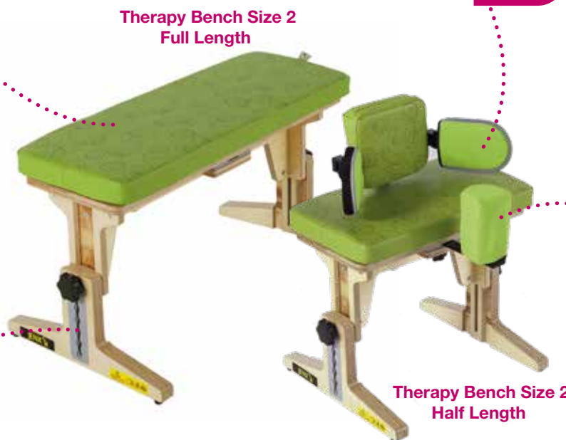
Therapy Bench Size 2 Full Length

The height of the Therapy Bench is easily adjusted using the bolt. The height adjustments are in easy to see increments, and the legs lock securely in place, ensuring a stable base at the appropriate height for each user.