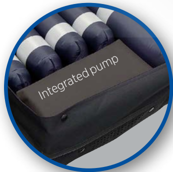
Unique design reduces facilities' repair cost by integrating pump into mattress