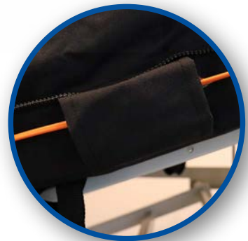
Cord retention management to prevent tripping hazard